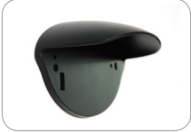
WC_HR50 Weather cover for the HR50 sensor