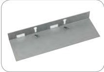
UTB-HR100 Ceiling attached bracket