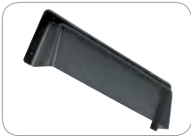
WC/BL Black weather cover