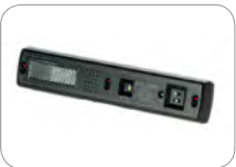
BF-1 Spot-finder installation tool