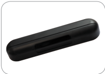
SSR-3-COV/BL Black sensor cover SSR-3-COV/S Silver sensor cover